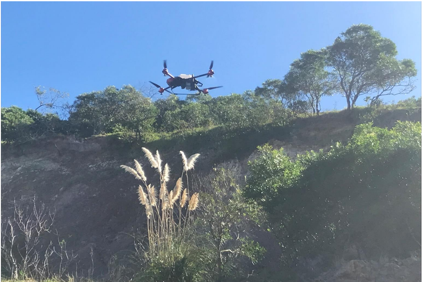
Pampas grass control- Bombo quarry