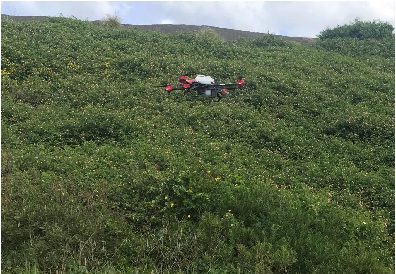
Bitou bush control- Bass Point