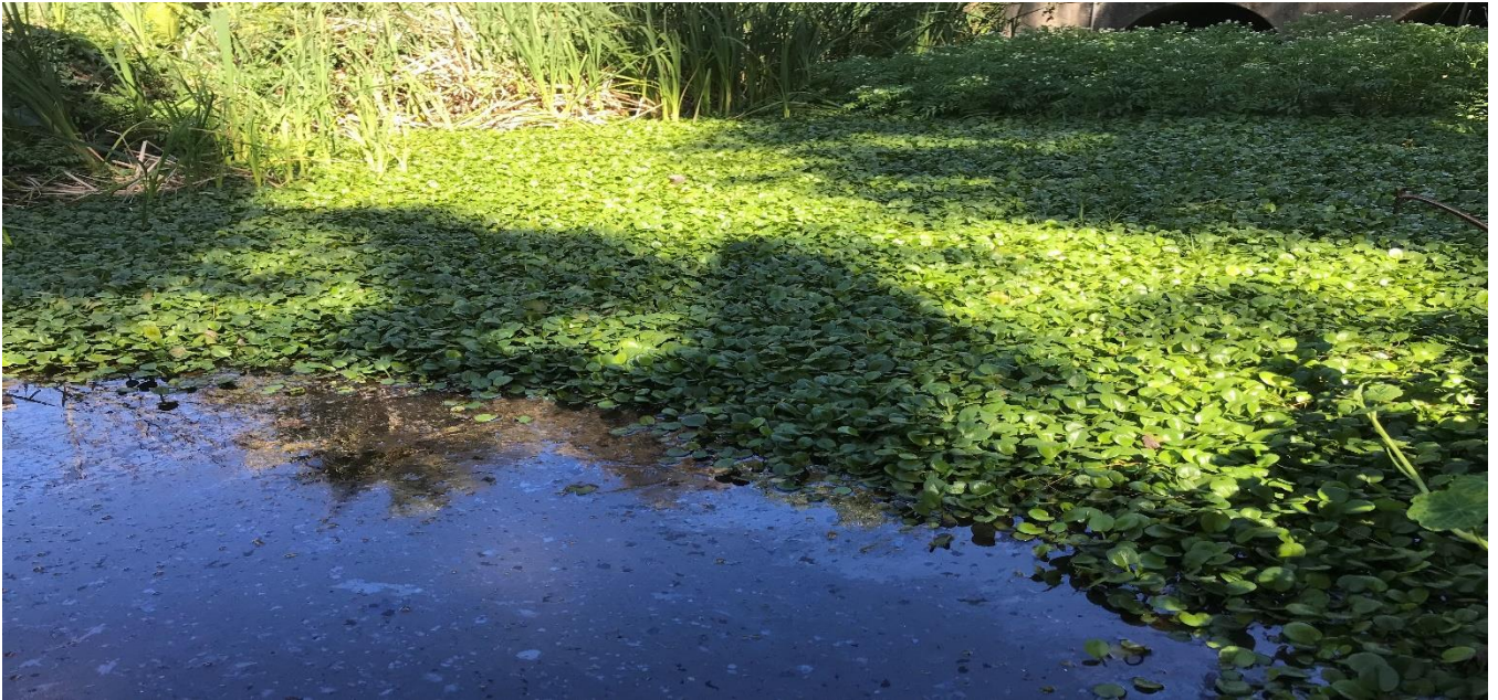
Frogbit incursion – East Corrimal- Sept 2023