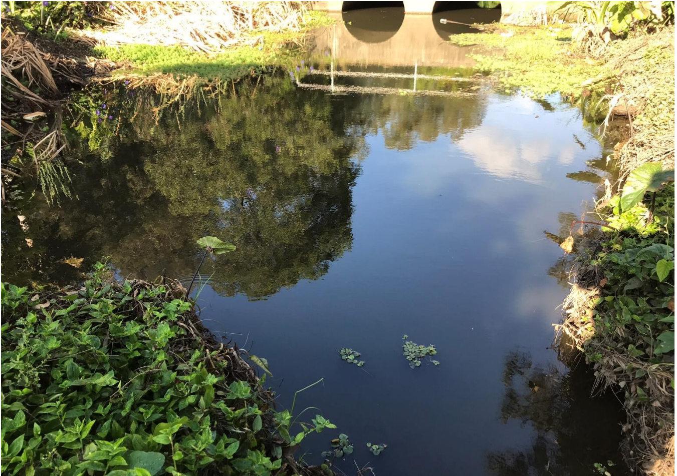
Frogbit incursion – East Corrimal- November 2023.

Staff from the NSW DPI have also begun eDNA testing the site as part of an early alert tool to determine if Frogbit genetic material can be found from environmental samples (eg water) without any obvious signs of biological source material being present at the site. Every species has its own barcode, just as every person has their own fingerprint. These DNA barcodes can be compared to a reference library to provide an ID and determine if the suspect weed is still present, despite not being visible to the naked eye.